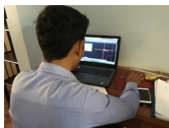
Drawing 2D map of the client's building

Work Experience is not always teeming with delight. There will be days where you will be given interesting tasks to do, but other days where you have no work at all. However, as someone who has already spent 52 hours doing work experience, I have come to a realisation and conclusion that this will inevitably be the reality of work. Whether you perceive this to be good or bad is not of concern but the sole purpose of work experience is to open your eyes and see how the world doesn't revolve around you anymore. It is a significant point in life where one explores the theme of self-relevance.