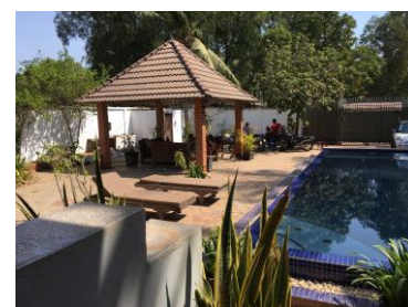
Discussing construction plans at the new site

I was given various tasks ranging from summing up company expenses to measuring dimensions of apartment complexes requested by clients, desperate to reopen a hospitality business; a very familiar industry in Siem Reap. The office workers were often on their computers drawing 2D and 3D models of buildings using softwares such as AutoCAD, Sketchup and Revit. They are hardworking people and it takes a special amount of effort to be do a full time job while still going to university.