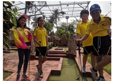
5A enjoyed a trip to Angkor Wat Putt. As well as having a lot of fun, they were also thinking about the correct angle at which to hit a golf ball to send it towards the hole. There were plenty of holes in one!

We recently sent home a letter asking if your family will be returning to ISSR for the next academic year. This information is essential for us to successfully plan for next year. Please return this form to your child's class as soon as possible.