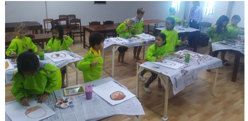
Art Club enjoy getting messy with paints.

ID Badges are an essential way for us to know who does and does not have permission to be on our campus. They are used to keep everyone at ISSR safe. Therefore, all family members/carers are reminded to wear an ID Badge at all times while on our ISSR campus, including morning drop off, afternoon pick-up times, and for any meetings/visits. Thank you in advance for your understanding, as we all work to keep the children and adults at school safe. If you do not have a badge or forget your badge, please see the office and they will be happy to help you. Please, do not be offended if a member of staff asks to see your badge.