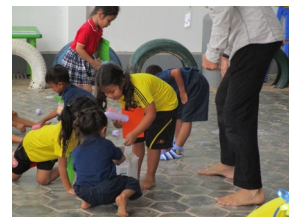
Reception 2 were visited by some friends from JPA last week. They all had lots of fun getting to know more about each other