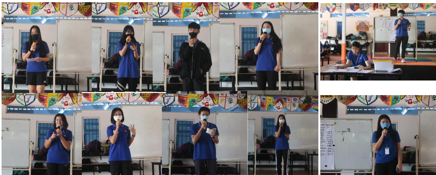
The SRC Candidates Pitching Their Best To The ISSR Population.