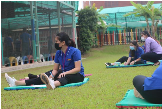
Art lessons being conducted outdoors.

Such a disciplined group of students of ISSR.