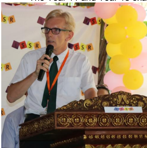
The Principal delivers the valedictory speech encouraging the students to explore the world