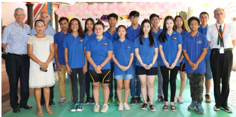
The Year 11 and Year 13 examination candidates and leavers

The Principal awarded certificates of Special Merit, recommended by the teachers, to students in Y11 and Y13 who have made significant contribution to the life of the School during the academic year.