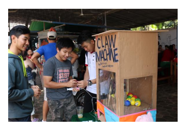
Delighted customers at the game machine.

On the 3rd February staff and students gave up their Saturday morning to volunteer to run activities and stalls for the annual school fair, which raises money in support of Angkor Children's Hospital and Kantha Bopha. The fair was a great success and raised $2023 for these charities. The school fair once again demonstrated that the Primary and Secondary sections of ISSR can work together as one, to support such initiatives within the school. Thanks to all the teachers and students who used their diverse talents and creativity to provide activities and stalls for the event.