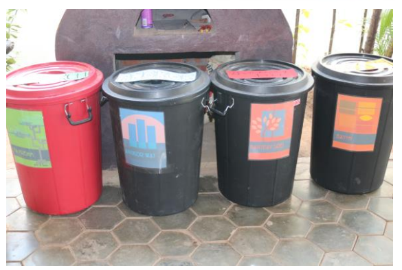
Collection Station for the Houses.