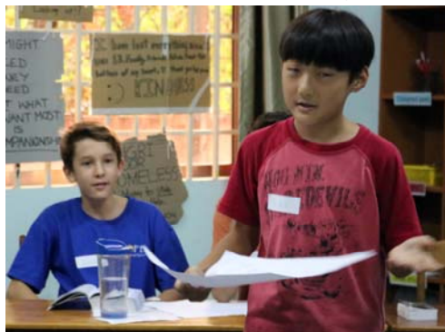
Students from HOPE School argue their case!