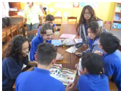
The Committee for the mammoth task of the School Year Book