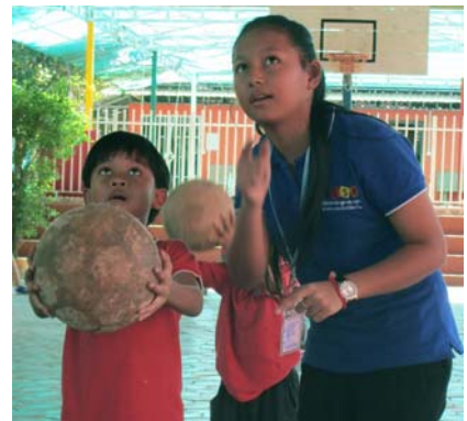
Primary School Service

Psychology: students in Y10 and 11 who are pursuing additional courses in not only Psychology but also Communication and Presentation skills are adding a highly valuable dimension to their IGCSE programme.