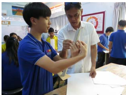
Art and Design project