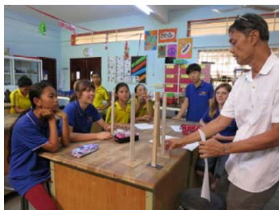
Preparing the Art in the Open Project

The new ECA programme for every student in the High School has had an excellent start with students participating in one of Performing Arts, an introduction to Psychology, Communication Skills, an open air art project, Primary School service and the creation of the High School Year Book.