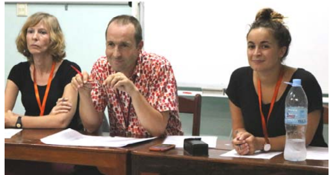
Adjudicators from Hope School, ISSR High School and ISSR Primary School