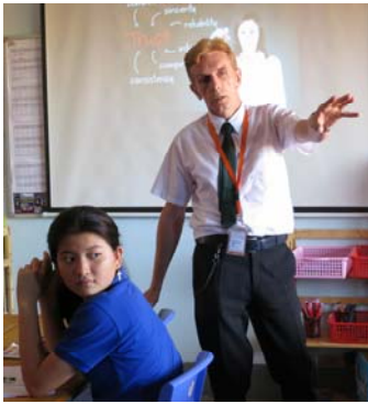
Communication and Presentation