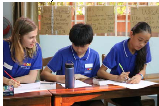
ISSR Lower School Debating Team