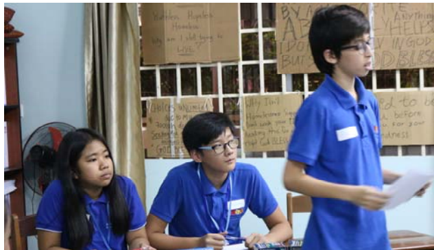
ISSR Upper School Debating Team