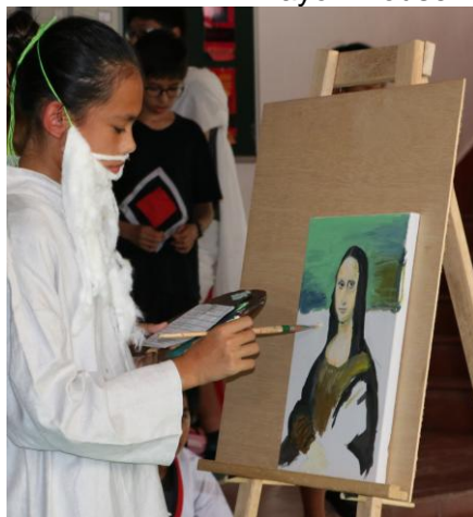
Leonardo Da Vinci makes an appearance