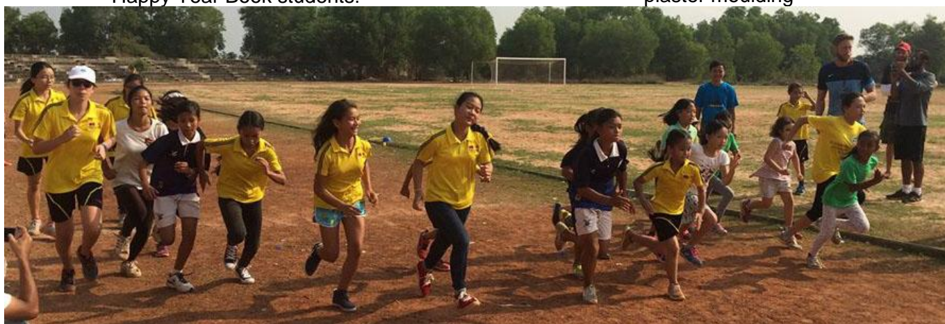
Inter-schools athletics: Saturday, 25 th March