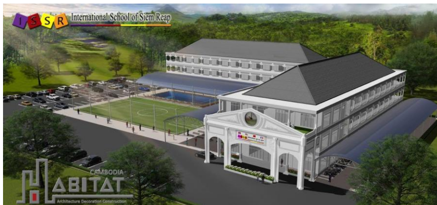
Artist's impression of the new campus