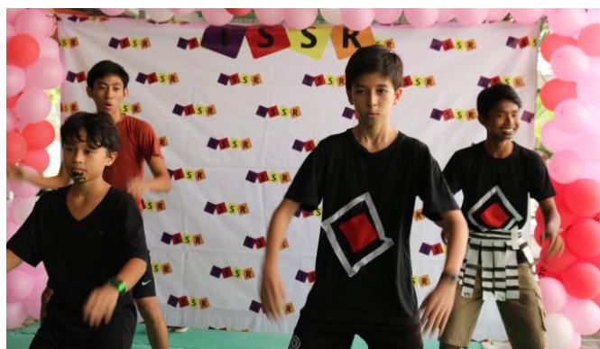
Banteay Srei performs the Haka