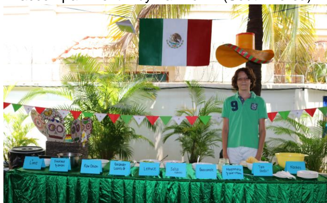
Angkor Wat House with its delicious range of Mexican food