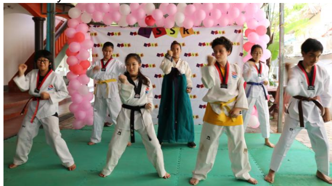
Tae Kwon Do display – with musical accompaniment – by Ta Prohm (South Korea)

The students came into school on Saturdays in advance of the event itself in order to prepare, and it was particularly encouraging to see different age groups working together, which is one of the benefits of the House system.