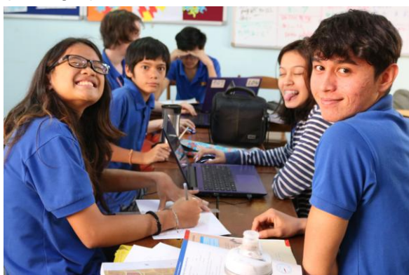
Happy Year Book students!

The High School is very conscious of the responsibility it bears in representing the student body. Councillors meet regularly for working lunches and, at times in liaison with the House Leaders and teachers, discuss matters pertaining to the development of the School and the preparation of events. In the photograph above, the Council are considering proposals for international day.