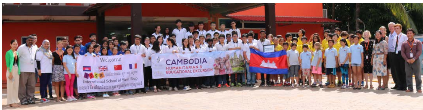
ISSR welcomes the students and staff of Austin Heights International School, Johor, Malaysia October 6 th , 2016

Visit by Austin Heights International School