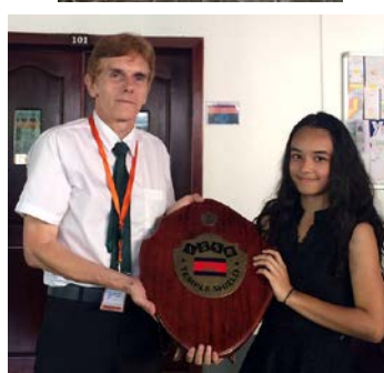
The winning House: Angkor