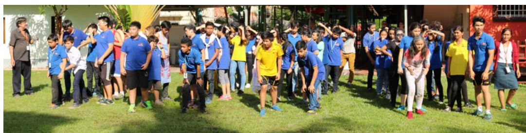
Getting ready for the games