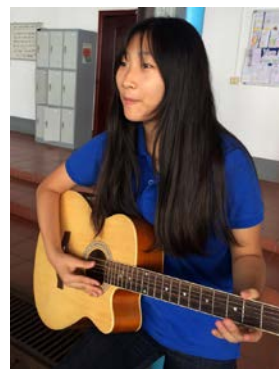
Extensive preparations by all the students for the Halloween inter-House Competition