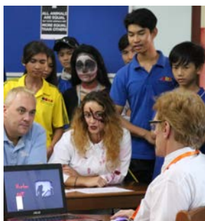
Staff face tough questioning from the quizmaster