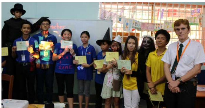
Recipients of the attainment and progress awards for August to October 2016