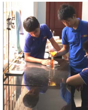
Y10 Science: Chromatography / Filtering sand and salt