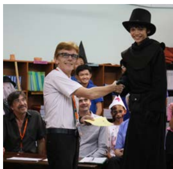
The Principal presents the attainment award to the world's tallest Year 9 student.