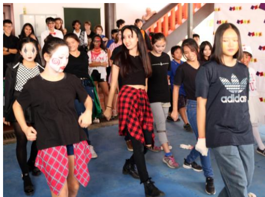
Performance Winners: Angkor Wat