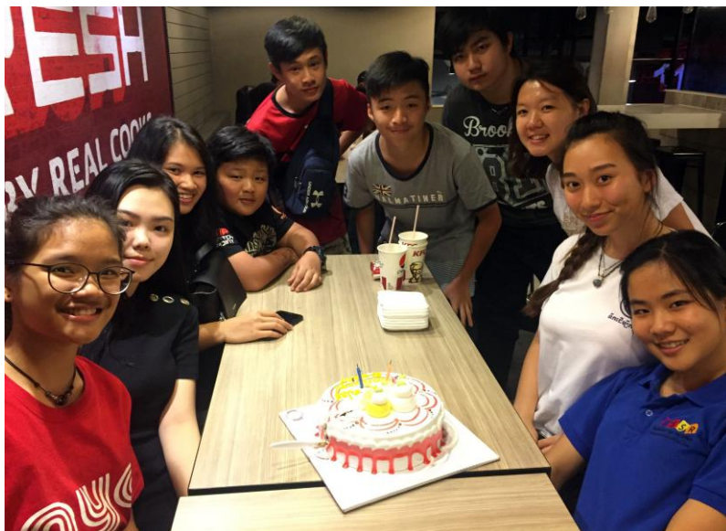
ISSR and AHIS students enjoy birthday cake and KFC on the farewell evening of the visit.

Finally, I would like to inform the Malaysian students that you will be participating in a range of exciting activities with our students. This will include various team games such as Tug of War and Human Knot. You will be put in a specific house and will help your house win points for their team. I hope you will work well together and I hope a lot of fun will be had too. Thank you for listening. Enjoy your day at the ISSR.