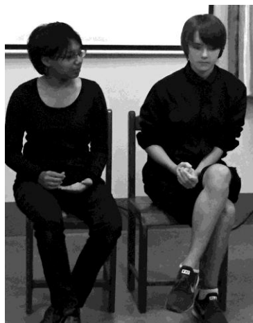
Year 10 IGCSE Drama students undergo their first performance assessment