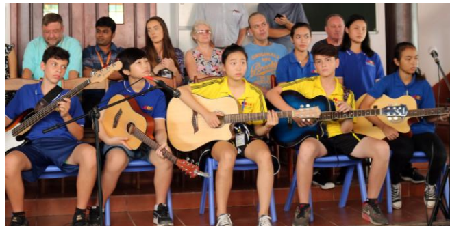
The Guitar Ensemble waiting to perform