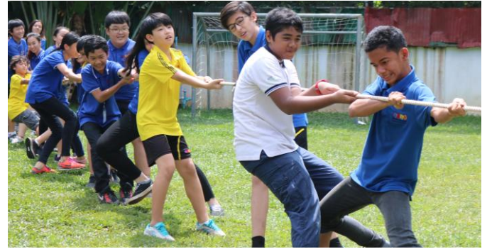
AHIS join the Houses for the tug-o-war

Tambahan pula kami berharap agar lawatan ini boleh membawa faedah kepada para pelajar di Kemboja dari segi persefahaman dan interaksi dengan negara-negara dan budaya lain.