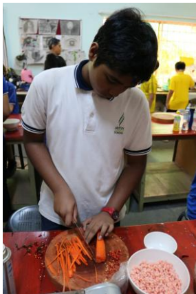
AHIS participant in the ECA programme

In addition, we hope that this visit can benefit the students in Cambodia from the point of view of mutual understanding and interaction between other countries and cultures.