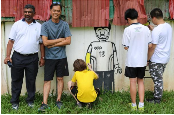
Art in the Open