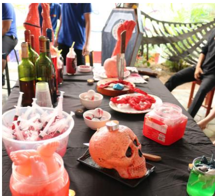
Courtyard Decoration Winners: Ta Prohm's gruesome Halloween buffet