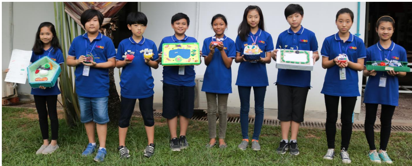
The School at Work: October 2017