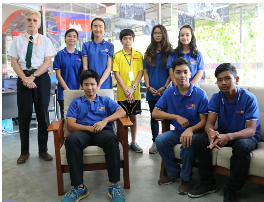
House Leaders and Deputy Leaders 2017-18