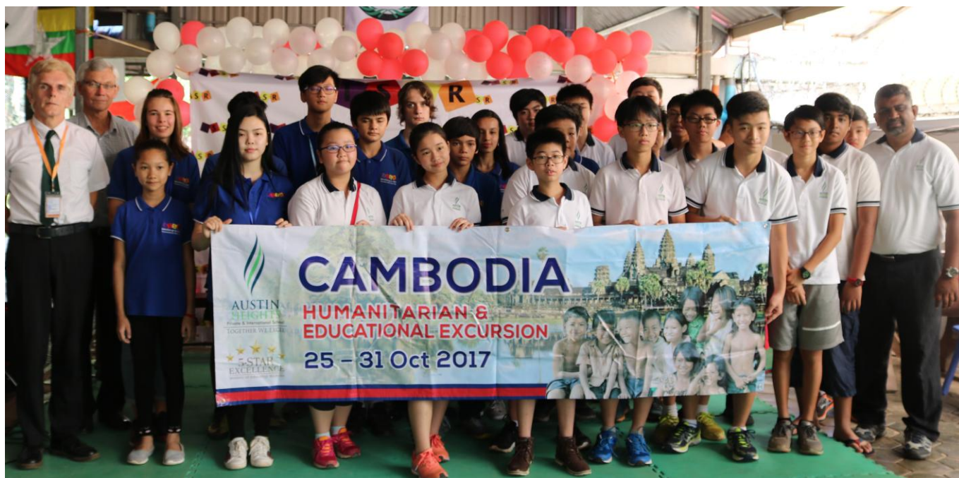
The Students and Teachers of Austin Heights International School, Malaysia with the High School Council, Principal and Director of ISSR High School: October 27 th 2017