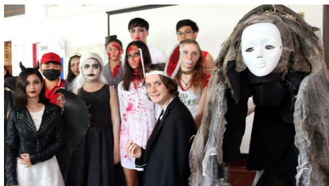
Costume competition Winners: Bayon