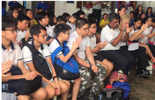
AHIS students show their appreciation for the Khmer traditional dancing.