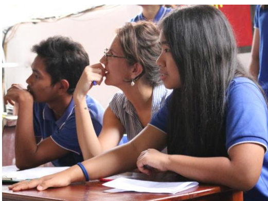
Quiz Winners: Banteay Srei