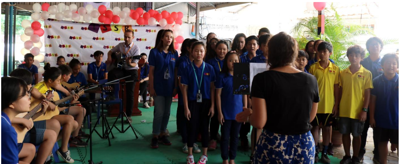
The School Choir accompanied by the ECA Guitar Ensemble