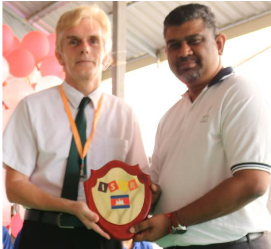
Presentation of ISSR plaque