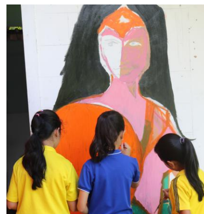
Finished product coming soon!