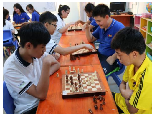
Malaysia v Cambodia chess game