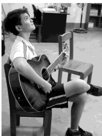
He's either being thoughtful or he's spotted a fly on the ceiling.