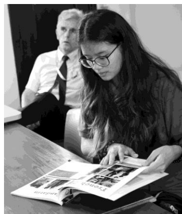
The Year Book Committee begins its long journey through the rest of the academic year, reflecting upon last year's publication, allocating roles, deciding on content, selecting from thousands of photographs, and gathering reports and examples of students' work.