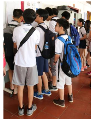
AHIS students select their lunches.

Diharapkan bahawa hari ini adalah tahap yang seterusnya menuju lawatan yang berpotensi sekolah kami ke Malaysia. Secara peribadi saya tidak sabar-sabar untuk membincangkan tujuan ini dengan wakil-wakil Austin Heights. Buat masa ini kami sudah menganjurkan hari yang sibuk dan minggu yang penuh dengan pengalaman baru.