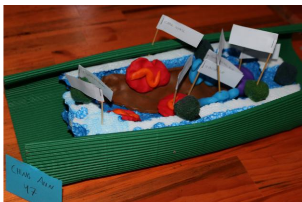
3 rd place: Ching Ann