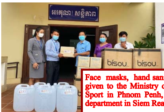
Face masks, hand sanitiser, and gloves given to the Ministry of Education and Sport in Phnom Penh, and also to the department in Siem Reap.

The final day of school for the academic year 2020-2021 will be Friday 18th June. School will close at 11am for both English and Khmer classes.