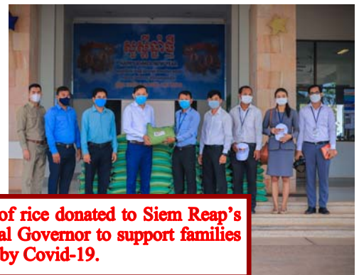
1 tonne of rice donated to Siem Reap's Provincial Governor to support families affected by Covid-19.