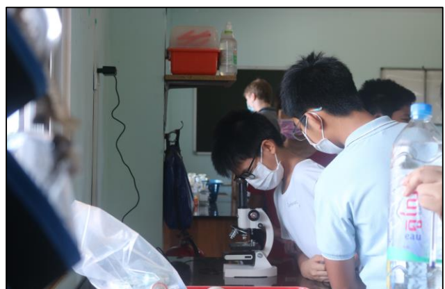
Welcoming the new cohort to High School