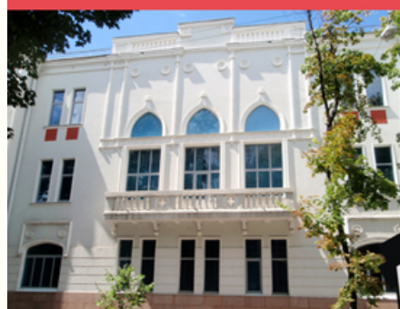
National Pedagogical University, founded in 1804