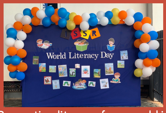
'Promoting literacy for a world in transition: Building the foundation for sustainable and peaceful societies'.