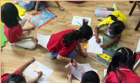
FUN WITH FLAGS