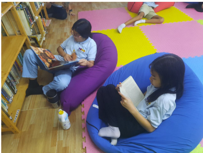
Relaxing and reading in the library.

High-frequency word spelling tests were completed, and they worked on their cursive writing in their notebooks.