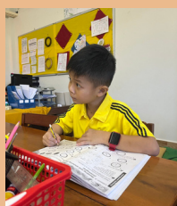
Y5 SCIENCE FAIR