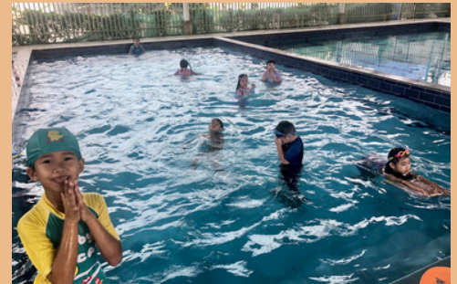
PE AND SWIMMING