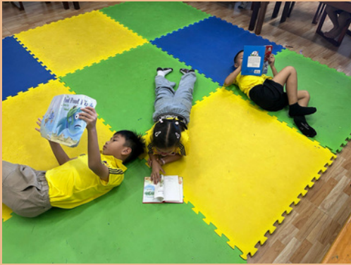
READING WITH FRIENDS