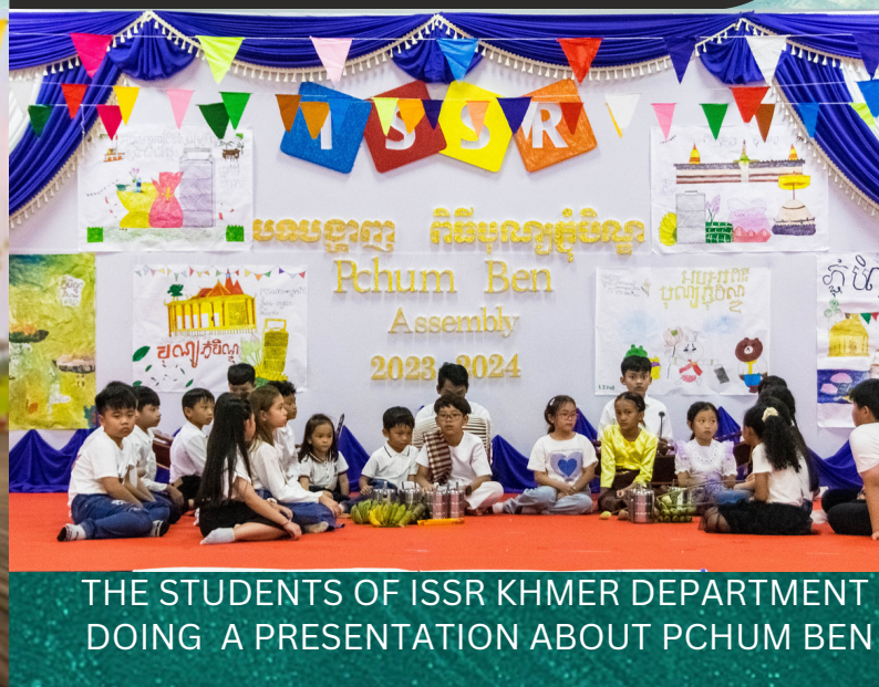
THE STUDENTS OF ISSR KHMER DEPARTMENT DOING A PRESENTATION ABOUT PCHUM BEN