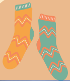
Odd Socks Day