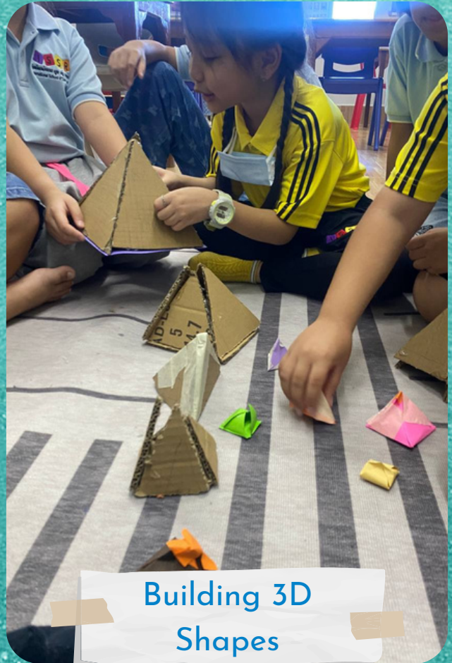
Building 3D Shapes